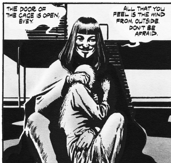
Escaping the Black Iron Prison. V for Vendetta by Alan Moore